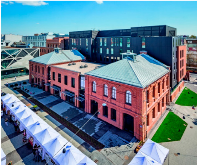
Figure 1. Centrum Praskie Koneser

We need to provide welcoming public spaces and comfortable housing for each of them and ourselves in the future.