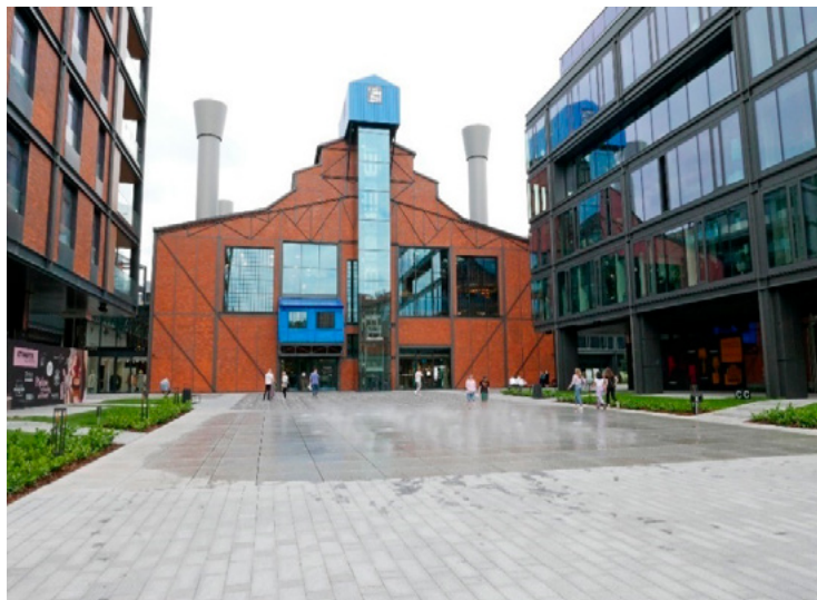
Figure 3. Powisle power plant

the engine room's suspended northern wall. The building's roof contains a distinctive blue shed that once housed the shaft's engine room. There is a charging station for electric cars with energy storage on the premises.