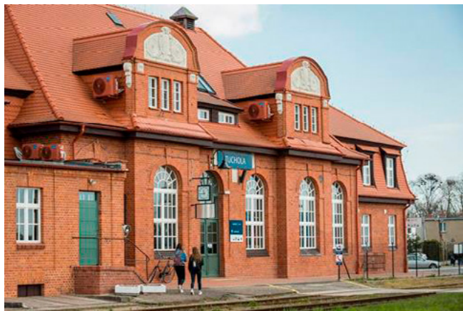
Figure 2. Tuchola railway station