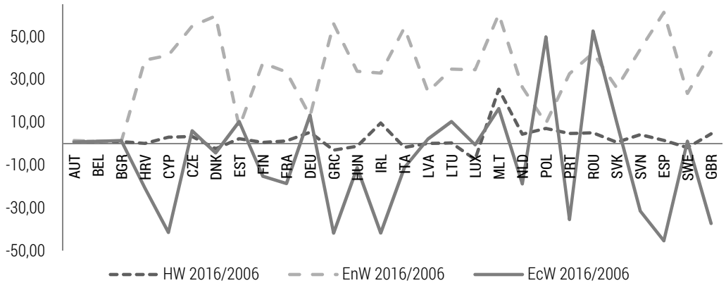
Figure 1. Dynamics in the evaluation of Wellbeing Dimensions in 2016 against 2006 in %

Key to the Figure: country codes are presented in table 5